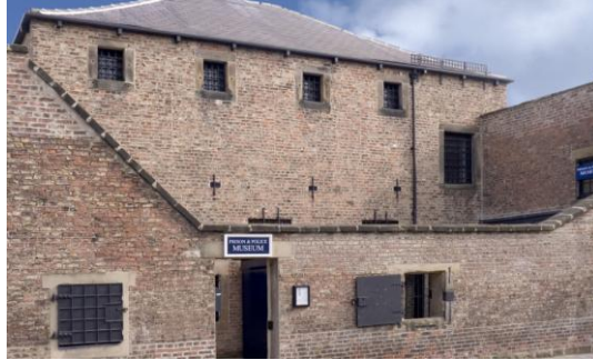
POLICE & PRISON MUSEUM