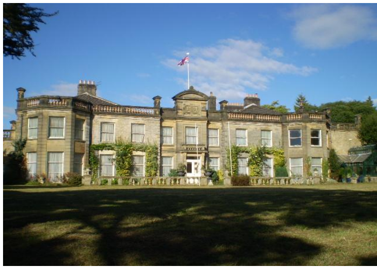
MOWBRAY HOUSE, KIRKBY MALZEARD

11 22:30hrs approximately - depart for the Hotel by coach.