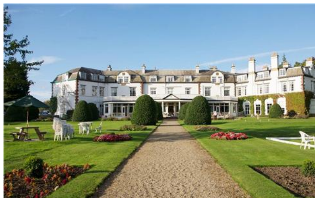
THE RIPON SPA HOTEL

Look on Google Maps and search for 'Allhallowgate, Ripon'. You will then see the various locations mentioned. You will get an idea of the walking distance and other amenities.