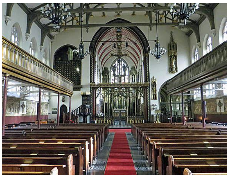
St Paul's Church, Knightsbridge