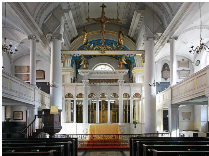
The Grosvenor Chapel, Mayfair