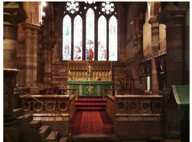
The Church of St Margaret of Antioch, Roath